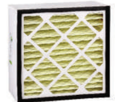
F8 Hospital grade Filter

The dry warm air from the roof cavity is taken through a high Quality F8 Hospital grade Filter Before it enters the home.